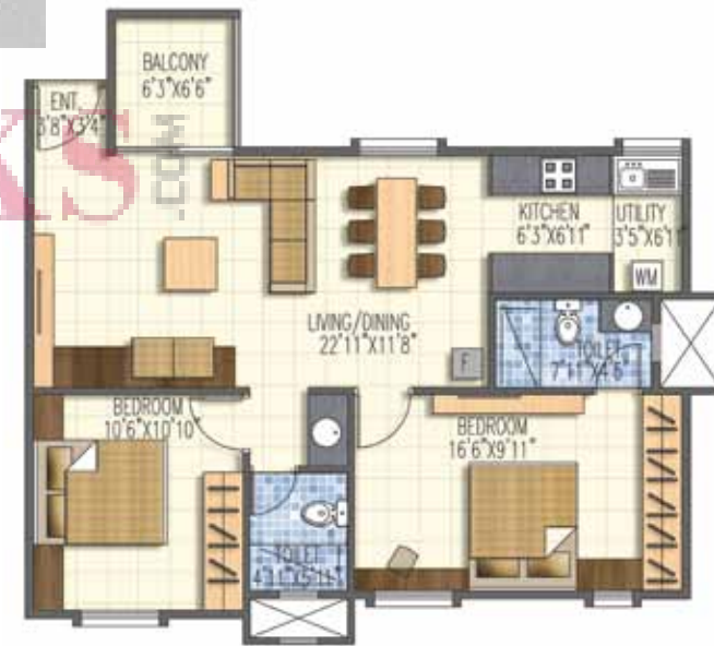
TYPICAL FLOOR PLAN: TWO BEDROOM UNIT 950 SQ.FT.