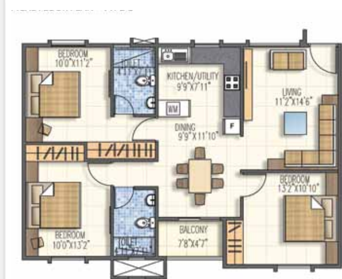
TYPICAL FLOOR PLAN: THREE BEDROOM UNIT 1150 SQ.FT.