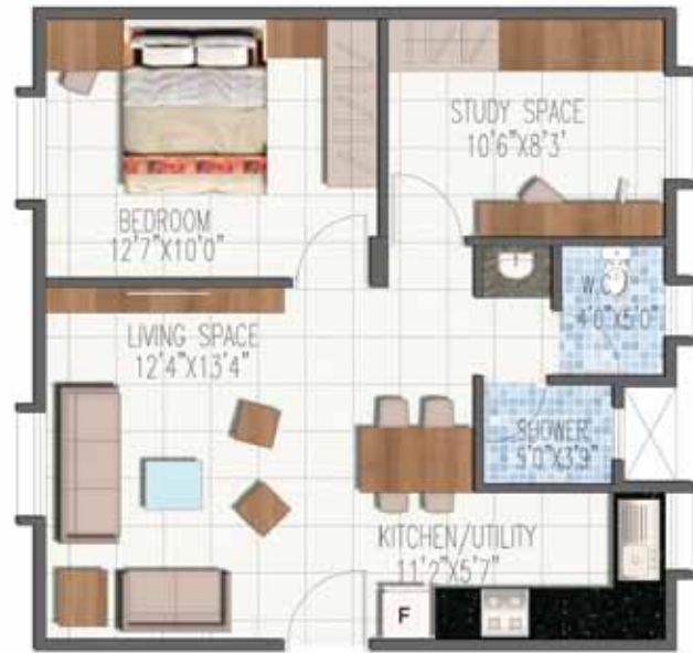
TYPICAL FLOOR PLAN: ONE BEDROOM + STUDY UNIT 700 SQ.FT.